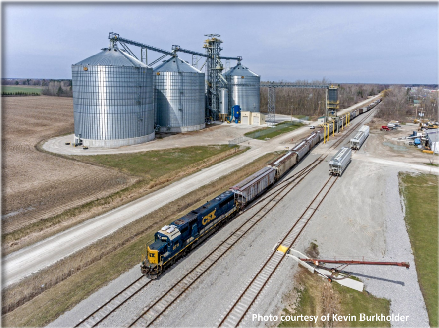
FEDP utilized to help with the site selection and construction of the Andersons facility in Standish, MI."