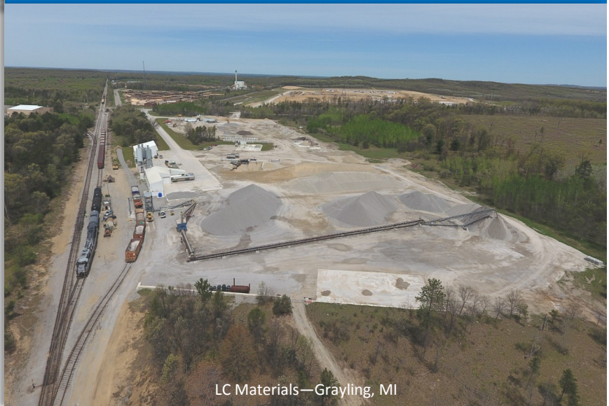
LC Materials—Grayling, MI