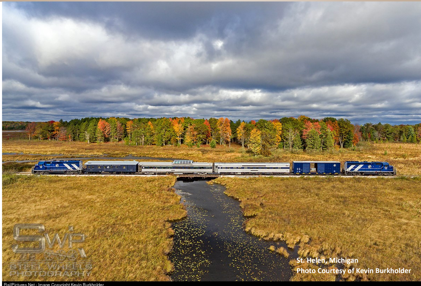
St. Helen, Michigan